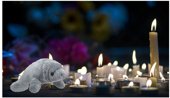
A candlelit vigil held outside MCMBI stadium

“What does this mean for house prices?” (pg. 16)